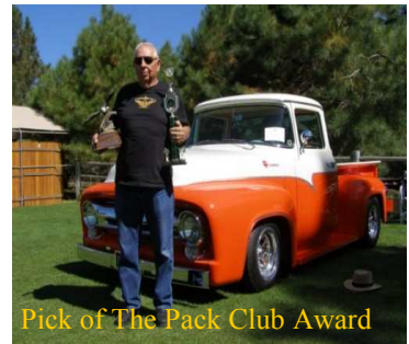
Pick of The Pack Club Award