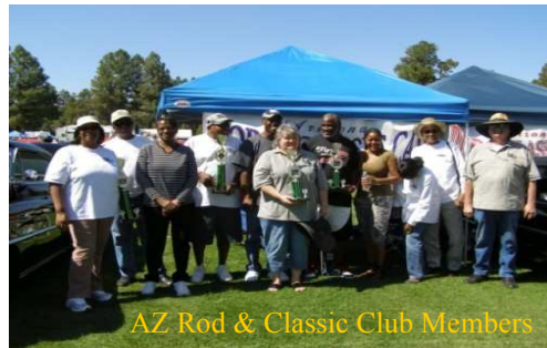
AZ Rod & Classic Club Members