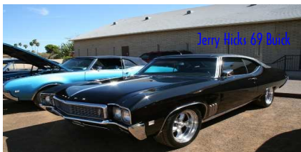
Jerry Higgs 67 Buick