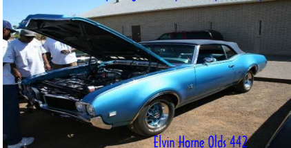
Elvin Horne Olds 442